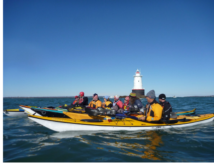
RICKA paddlers off Sakonnet Point in Little Compton

Surf and rocks present special dangers to paddlers. Surf is unpredictable and powerful, and rocks can smash you or your kayak. Only skilled paddlers should venture into these conditions.