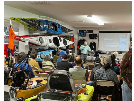
Last year's Get to Know RICKA Night at the Kayak Centre

The Kayak Centre is located in historic Wickford Village at 70 Brown Street . We hope to see you there!