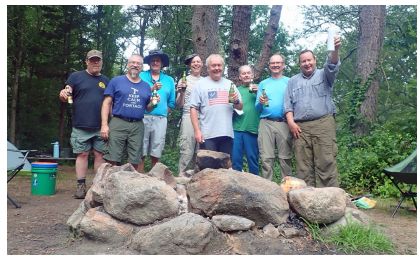
The traditional Molson Toast

It was celebrated with an assortment of French and French-Canadian delicacies – mostly wine and beer. A Molson toast around the fire was always the highlight of an evening filled with good food and good friends.