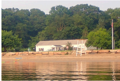
Cold Spring Community Center at the North Kingstown Town Beach

The 18 th annual RICKA Family Picnic will be held on Sunday, September 14 th at the Cold Spring Community Center at the North Kingstown Town Beach – a great location with gorgeous views of Narragansett Bay.