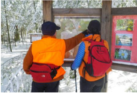
Checking the map

expect will help you react appropriately on the trail and bring the right gear.