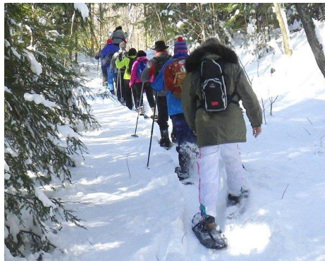
Snowshoes in light powder

For winter hiking, you will need comfortable, waterproof boots with a good tread, and good hiking socks. Hiking socks are usually made from wool or wool blends