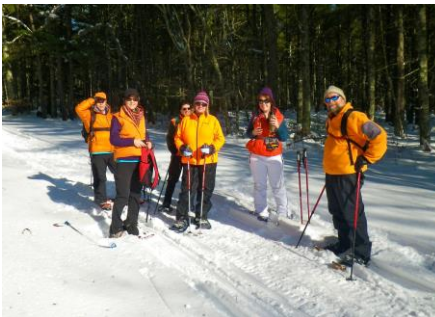
Keeping the group together

When hiking in a group it is important to stay together. Large groups often tend to separate into groups of faster and slower