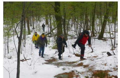
Up an icy slope

Snow and ice are the joy and the bane of winter hiking. Icy conditions can become particularly treacherous on hard packed, well-used trails. No one wants to slip and fall, so micro spikes are a good investment to help improve your traction. Yaktrax or