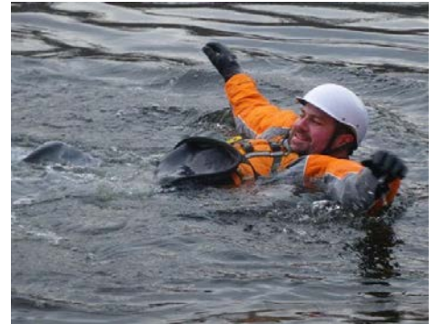
A drysuit will keep water out during immersion

go for a swim in splash wear, your inner layers will get wet.