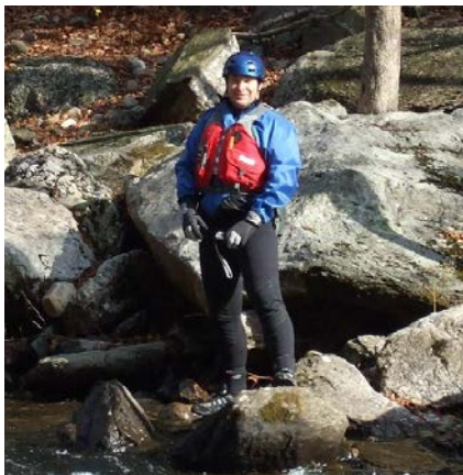
Early fall paddling in a wetsuit and splash top

Start with a moisture-wicking base layer next to the skin. Synthetic fabrics such as polyester, nylon and polypropylene are best since they don't absorb water and they move moisture from your skin to outer layers. Do not wear cotton. Cotton loses its insulating value when wet.