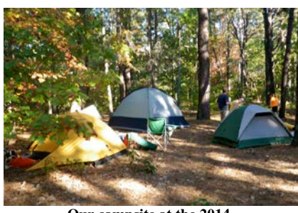
Our campsite at the 2014 Pawcatuck River Overnight trip

When carrying camping gear in your boat, <u>dry bags</u> are a must. Since there is nothing worse than being continuously wet on a trip, it is often a good idea to double bag critical items such as cloths and sleeping bags. Tents should also be packed in a manner that will keep them dry. If the