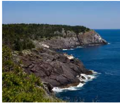
Explore Maine's scenic coast on the Maine Island Trail

The Maine Island Trail Association (MITA), a non-profit organization with almost 3,800 members, operates the trail. Detailed information about each site is contained in the association's Trail Guide , which updated annually and available only with MITA membership. To ensure good stewardship along the trail, it is important for all visitors to plan their trip using the most recent Trail Guide.