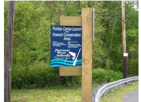
Check out the PRAWC's new Pontiac Canoe Launch and Howard Conservation Area

We offer group canoe/kayak trips, river cleanups and river festivals. Our monthly meetings are also open to the public. Additional information is available at www.pawtuxet.org