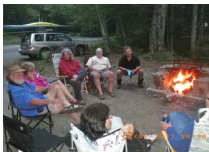
Enjoying an evening campfire

Another important part of paddling road trips is simply getting away and leaving the worries and cares of your "normal" life back at your house – setting your internal clock to "paddle time". It's one of the greatest time zones you can visit, where the