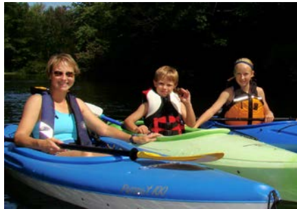
A family day in the Last Green Valley

I'm partial to waterfalls, including those created by old and partially breached dams. Cargill Falls in downtown Putnam is my favorite as I drive by every morning and love watching the mist rising over the river.