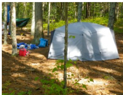
Setting up camp

There's a special kind of magic that comes