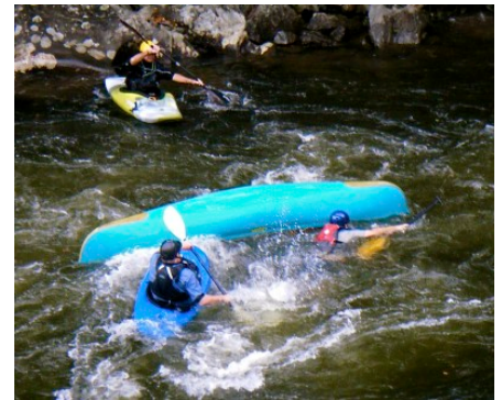
A swimming boat recovery on the Deerfield River