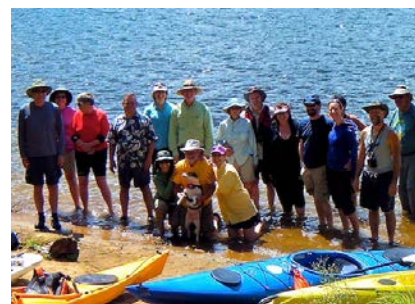
The crew from RICKA's 2012 Adirondacks Trip

So don't just sit there – let's take a paddling road trip!