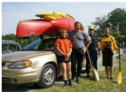
The boats are loaded – it's time for a road trip!

The boats are tied on the roof rack, and the gear is piled in the back of the car. The crew is settling into their seats, and the road stretches out before you as your day-to-day life fades in the rearview mirror. It's time for a paddling road trip!