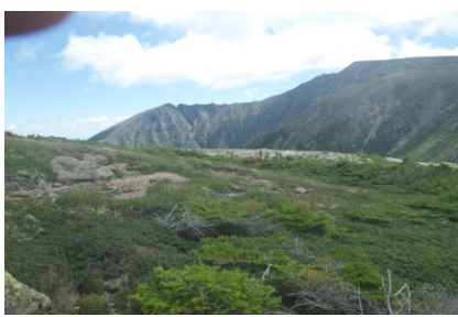
Top of Baxter Peak as Knife's Edge goes left to right crossing spine of mountain

celebrating completing the Appalachian Trail after 4 months of travel. It was a long day and I did chose to see another scenic trail. After being out for 11 hours I was double scrambled melted goop and looked and felt as if I was punch drunk.