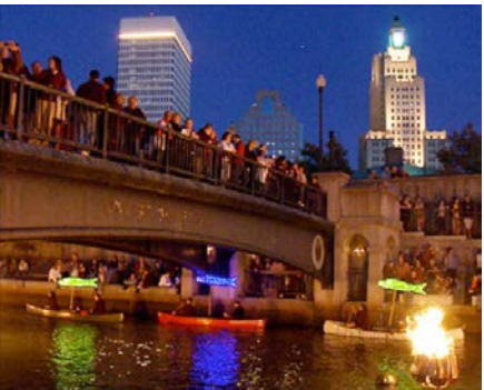
Kio fish floating up the Providence River during Waterfire last year.

Waterfire Providence is looking for <u>experienced</u> paddlers, who own a canoe or kayak, to join them at this unique event. Participants will check-in beginning at 4:00 p.m. at the Providence River Park public boat ramp on South Water Street. At 7:00 p.m. participants will receive a final onriver orientation. "Schools" of paddlers/fish will then "swim" up and down the halfmile long Waterfire installation from 7:30 p.m. till 11:00 p.m.