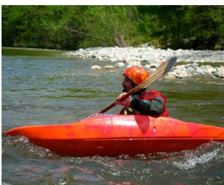
Moving in to (or out of) the current – the boat (not the body) is leaned into the turn

Another important component to an eddy turn is speed. The transition between the eddy and the main flow (also known as the eddy line) can be several feet wide and quite turbulent. Paddling across the eddy line with speed stabilizes the boat through this transition area. It also pushes the bow further into the main flow for a better turn.