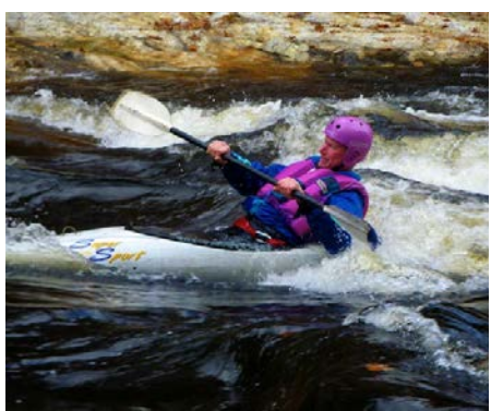
A stationary boat head on into the current – the boat remains flat, no lean is required

The second thing to understand about moving water is that current is only important in a relative context. If the boat is moving at the same speed and in the same direction as the current, than the interaction between the boat and the water is exactly the same as if both are stationary. It is only when there is a difference in speed or direction between the boat and the current that the dynamic interaction with moving water comes into play.