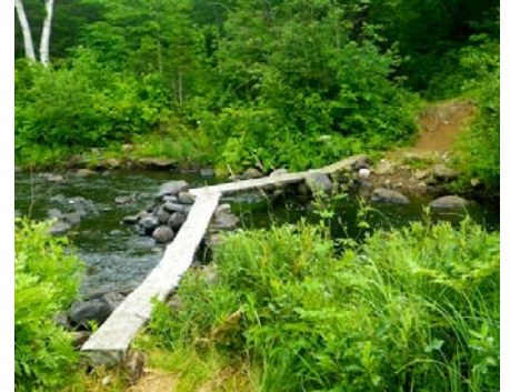
Turner Brook crossing bridge on Russell Pond Trail