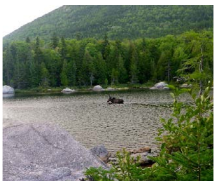
Moose feeding at twilight at Sandy Stream Pond

On my fourth night I had to move to a new campground about 30 miles away where there had been a bear break in the previous night. There was a young person who put on raspberry scented bug spray and thus enticed a black bear cub to tear a hole in the tent and find the berries. I was not scared but when the ranger told me to keep all of your food and cosmetic scents locked in your car, he did not have to say it twice. I've rarely heard stories about black bear mauling but from what I have heard the bears certainly know how to scare people into dropping their food. The rangers will mace or bean bag the bears and as last resort they will re-locate problem bears. From what I have heard the bears are not a