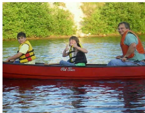
A fun family evening on the Slatersville Reservoir with the Blackstone Valley Paddle Club.

Paddling is a great way to bring the whole family together. By focusing on the