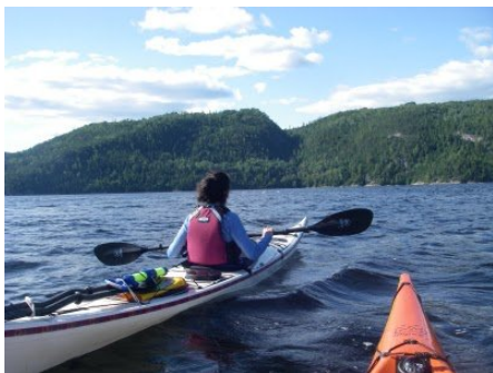
Paddling into a strong wind

As we set out again, the wind was blowing about 20 knots. The waves with an opposing tide had built to at least a 2-foot chop, and it was difficult for us to make forward progress. Fortunately, our first