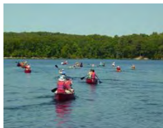
The lake at West Thompson Dam

For details and directions go to www.RICKA.org and click on "Flatwater". Please contact the listed trip organizer for details if you do not have web access. Changes and cancellations to trips will be posted on the flatwater message board. Please check the board before leaving for any trip.